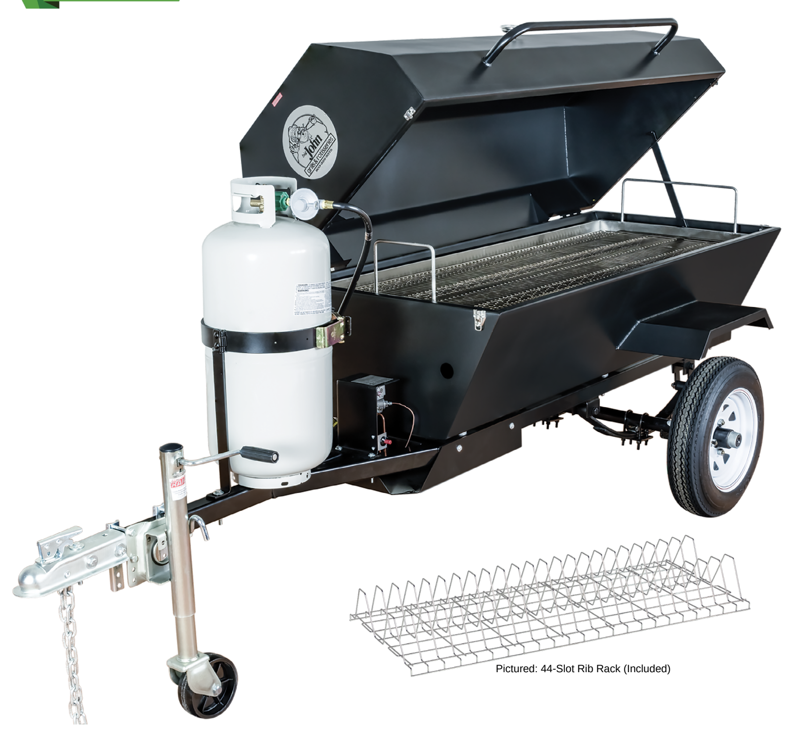
Pictured: E-Z Way Smoker/Roaster