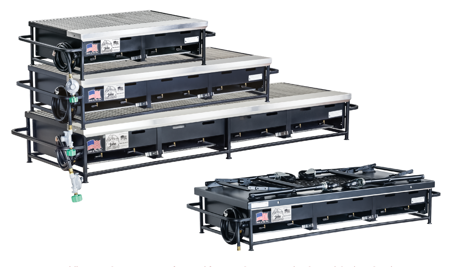
Folding Leg Carts are Manufactured from 11 Gauge Powder-Coated Carbon Steel