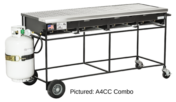
COMBOS include Stainless Steel Cooking Grates, 30 lb. Propane Tank, & Propane Tank Holder.