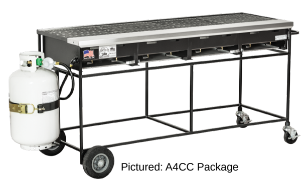
PACKAGES include Cast Iron Cooking Grates, 30 lb. Propane Tank, & Propane Tank Holder.