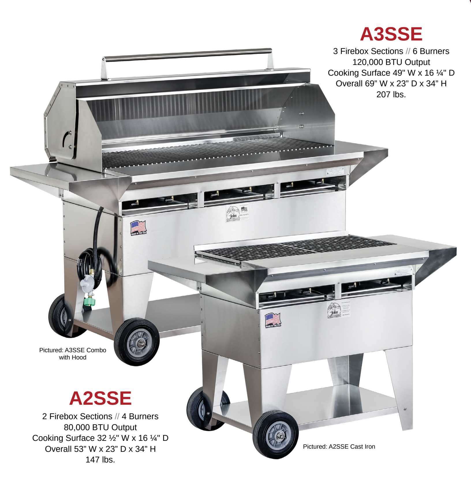
Body & Components Manufactured from High-Quality Type 304 Stainless Steel