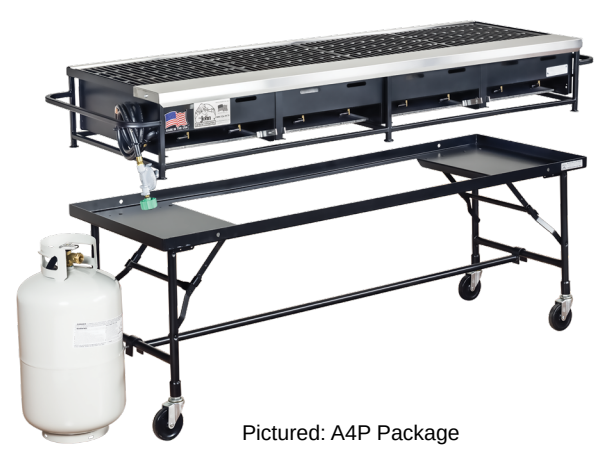
PACKAGES include Cast Iron Cooking Grates, 30 lb. Propane Tank, Folding Leg Cart, & Leg Brace