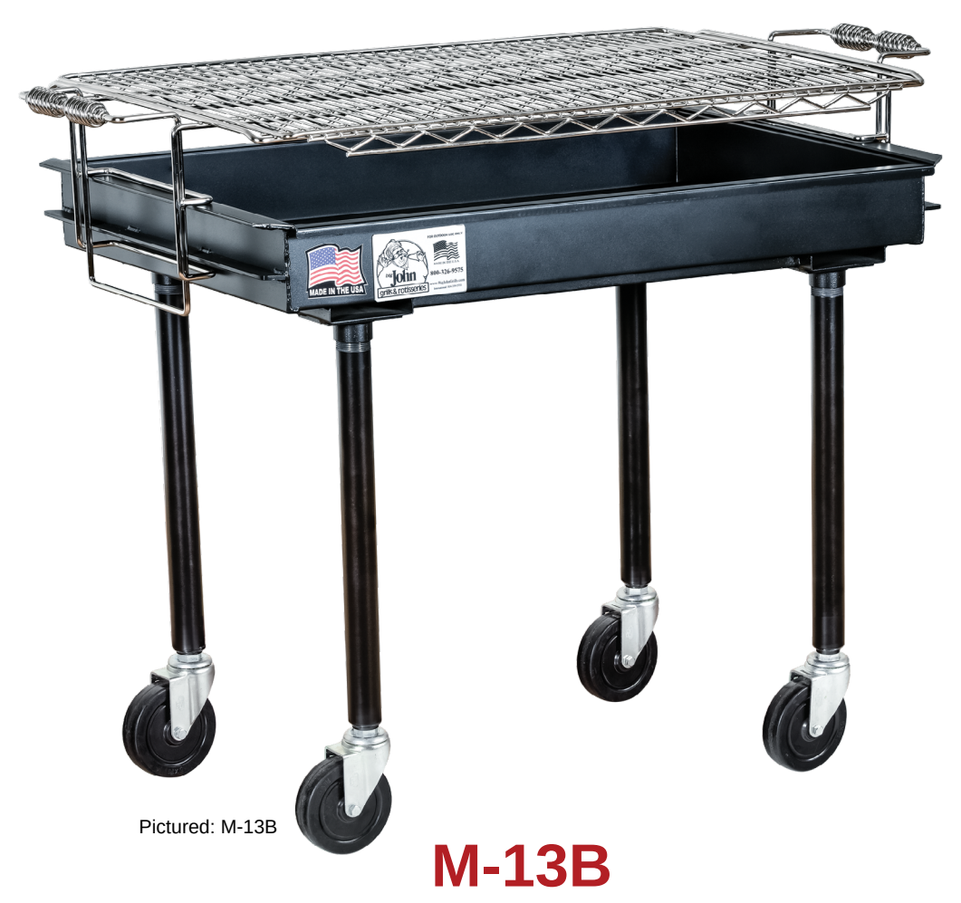
Screw-In Legs // 5" Casters Cooking Surface 3' W x 2' D // Overall 47" W x 24" D x 31"- 34" H // 94 lbs.