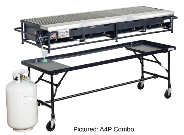
COMBOS include Stainless Steel Cooking Grates, 30 lb. Propane Tank, Folding Leg Cart, & Leg Brace